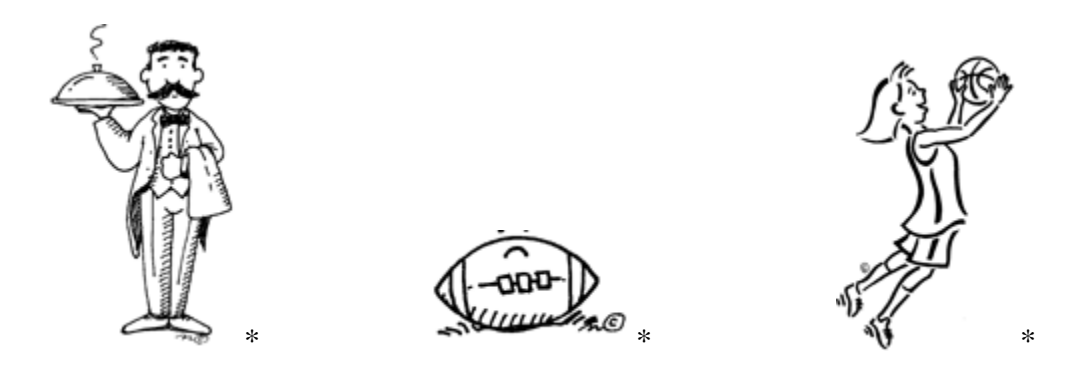
Principle 2: Non-essentials that people desire for emotional enjoyment are things like toys for their children, special foods, nice clothes and free time.

After people are fed, have a place to sleep, clothes to wear and feel secure that their physical needs are met, they still want things. They do not want to just survive, they want to have fun and have free time to relax. They want to go to parties! They want to eat food that tastes good. The waiter in the drawing is serving a fancy meal. The football will be a gift to a child. The girl's parents have made it possible for her to play basketball. The parents want good things for their_children. They want their children to have fun. They want to give them toys, good health care and a good education.