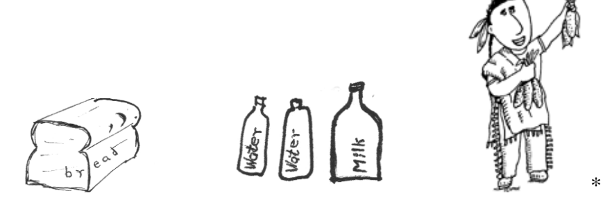
Principle 1: Essentials that people need for physical survival are food, water, clothes and shelter.

All people everywhere need food, clothes and shelter to survive. In the drawing we see bread, water and the man holding a fish. With those essentials he can survive. Food is considered to be necessary to nourish the human body. Generally, people who don't eat get very hungry. Eventually, if they don't have food and water, they die. Clothes are also needed. Without clothes, in most climates, one suffers from exposure to heat and to cold. Life without clothes, for most people, is very uncomfortable and in some climates it is impossible. Shelter is like clothes, it keeps the elements off the human body. It holds in the heat in cold climates and keeps out the heat in hot climates. It keeps the rain off our bodies our food and other supplies.